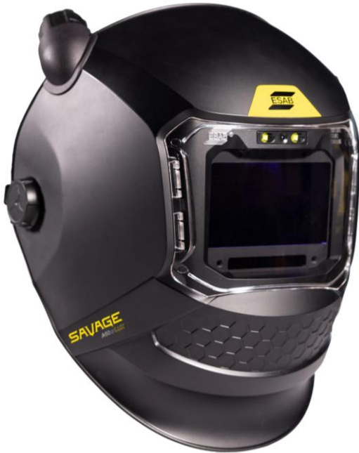
SAVAGE A50 Air LUX