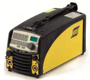
Caddy® Tig 1500i and Caddy® Tig 2200i