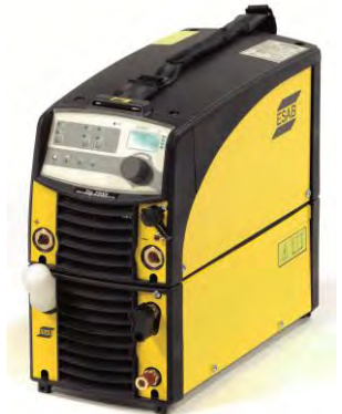
Caddy® Tig 2200i (watercooled)